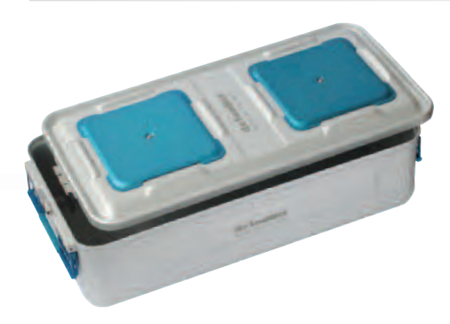
Order code 19250 Accepts standard insert tray Lid gasket - Order code 670023